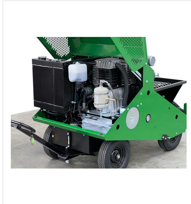
High Performance Cooler

Kubota diesel engine with combination cooler for engine and hydraulic oil temperature.