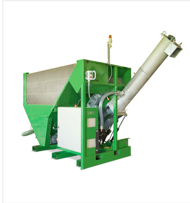
without gravel unit