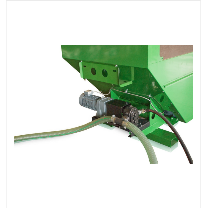
Suction pump and by-pass hose