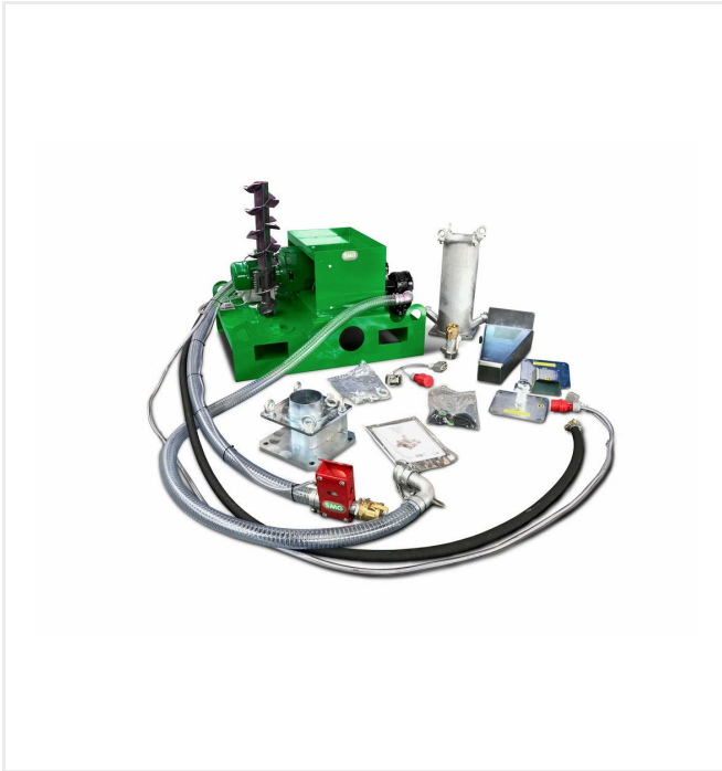
Portable metering pump for mixing polyurethane coatings (option 2)