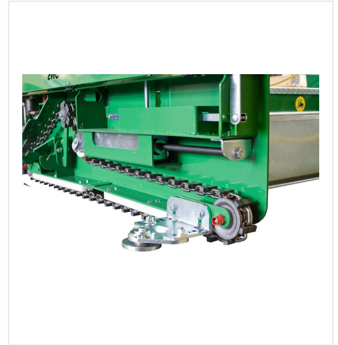
Repulse wheel for the installation alongside border stones