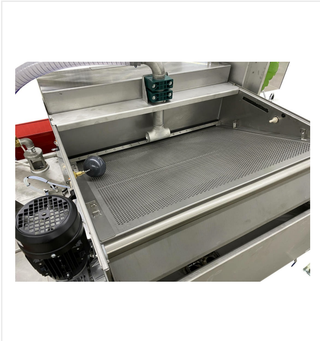
Belt filter with tear-resistant filter fleece (120 µm) including collecting container with float switch