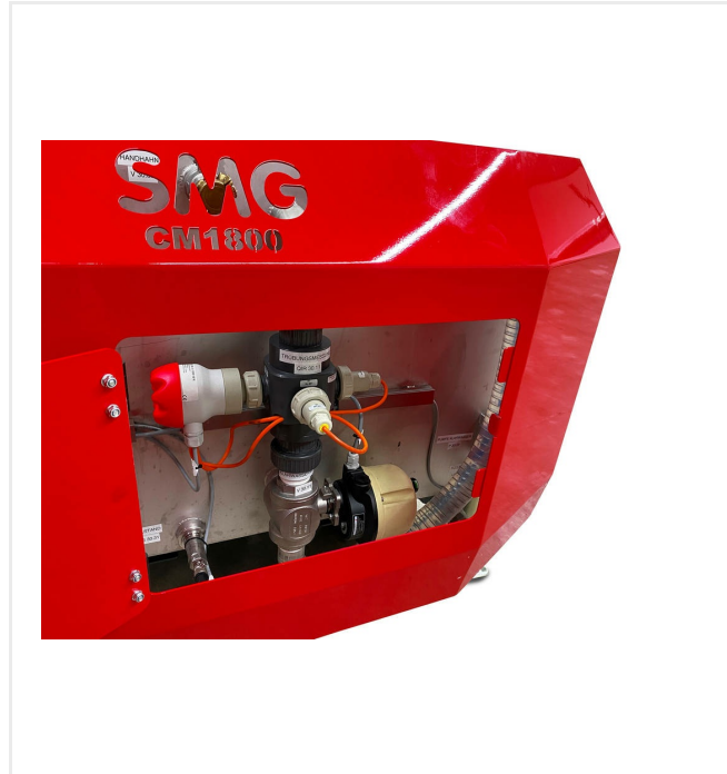
Sensors for checking turbidity, flow and fill levels