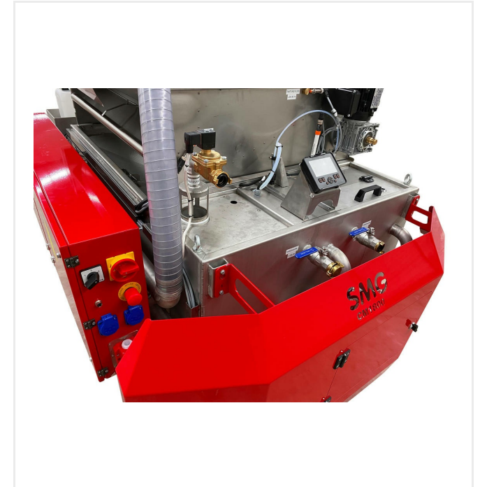
Central switch box with display for controlling all pumps, etc.