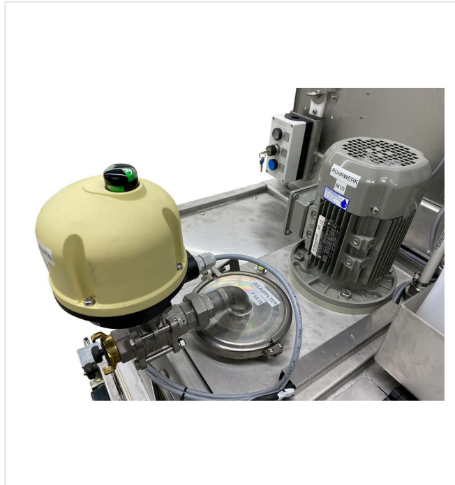
Waste water tank with integrated entry inlet filter (<5 mm) as well as stirring device