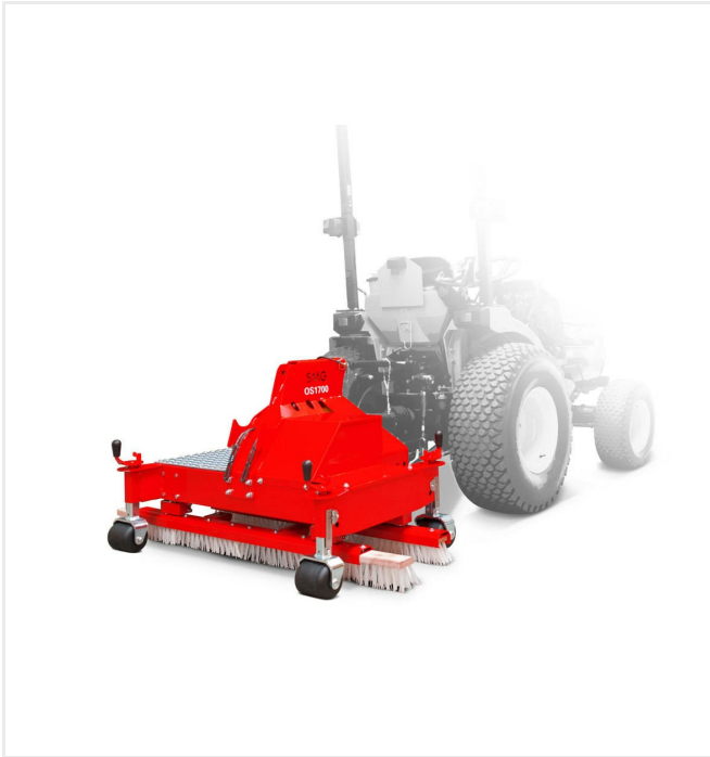
oscillating brush OS1700/OS1700 PTO