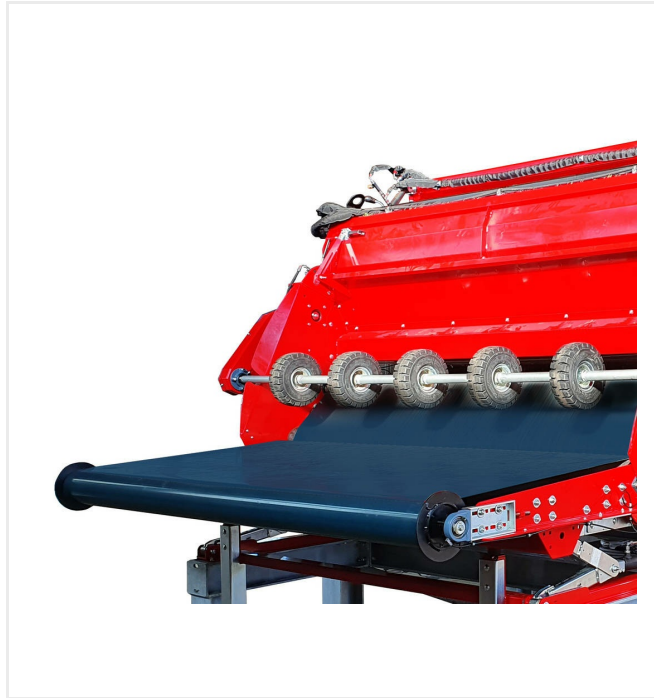
Rewinder for rolls with idlers