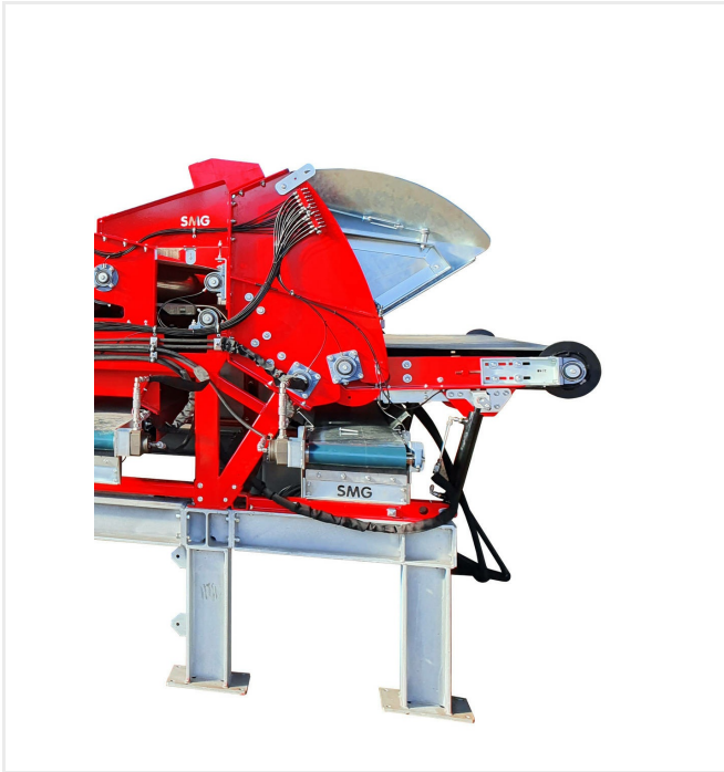
Input area for artificial turf rolls