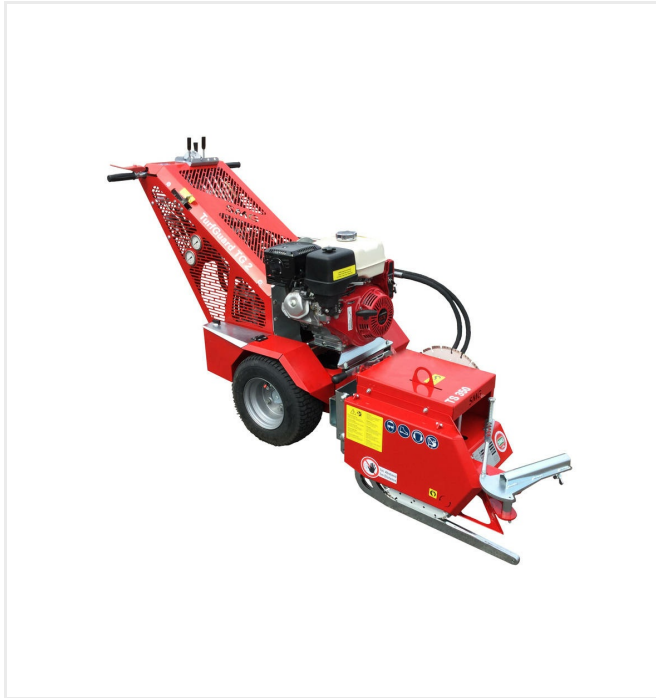
TurfSaw TS350 with attachment TurfGuard TG2