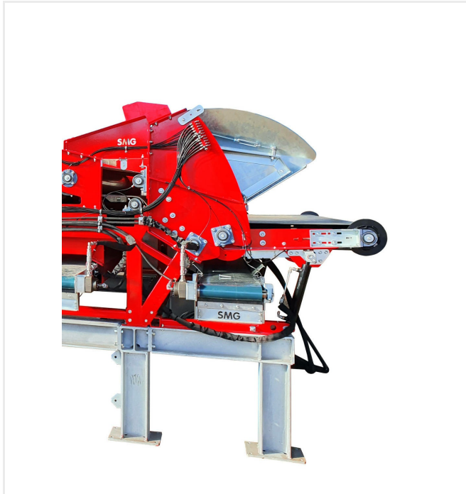
Área de entrada de rollos de césped artificial