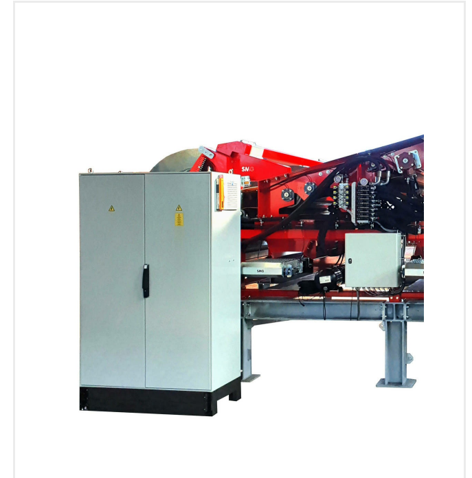
Panel de interruptores con mandos