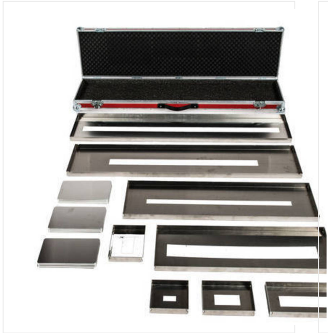
Mark stencils set for running tracks