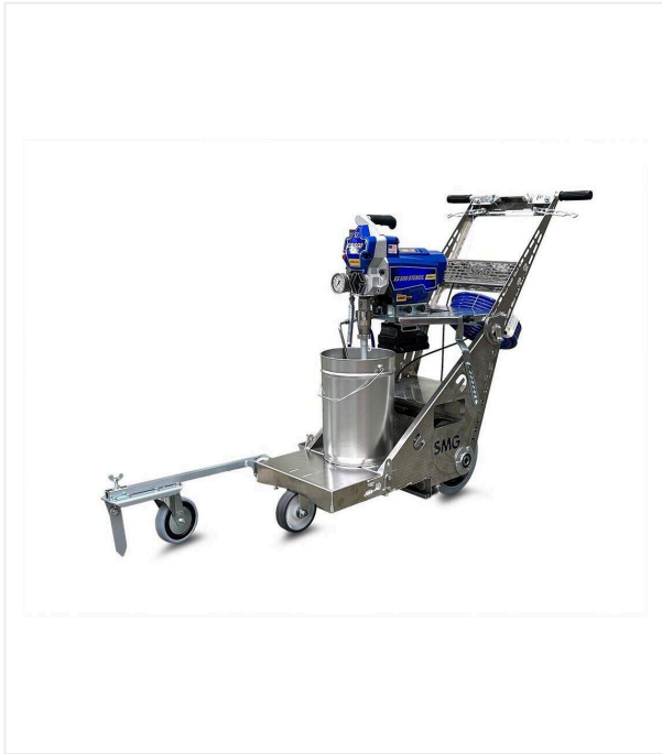
LineStar LS1 DC