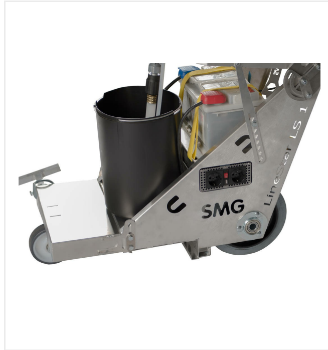
Driven by 12V vehicle battery (not in the scope of delivery)