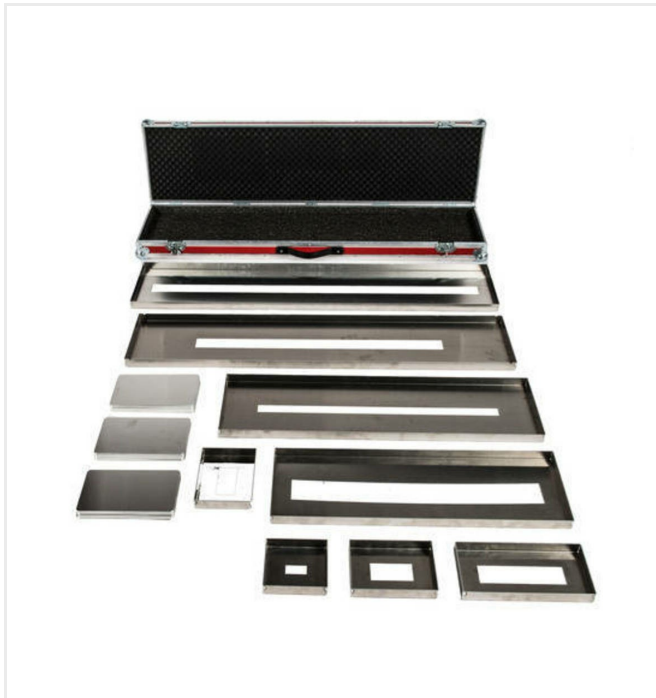
Mark stencils set for running tracks