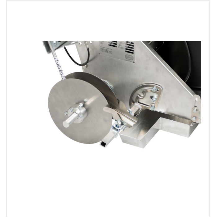
Striping unit and drip pan