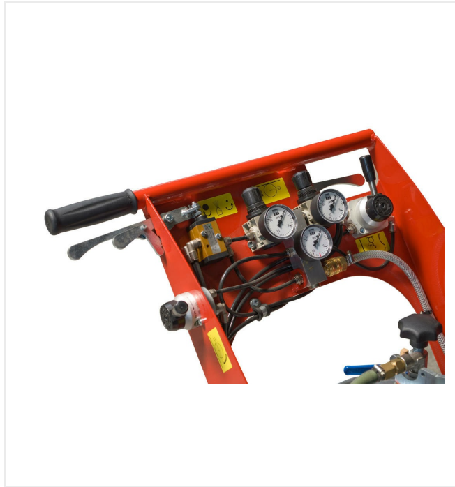
Pneumatic control of all functions, clearly arranged