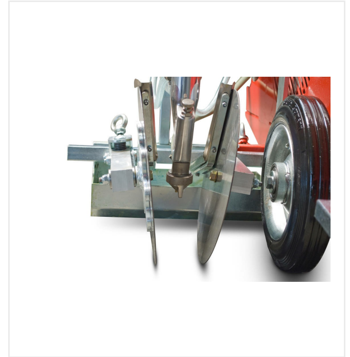
Striping unit with limiter discs, line width adjustable