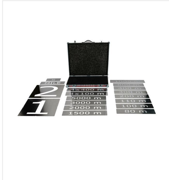
Letter stencils set