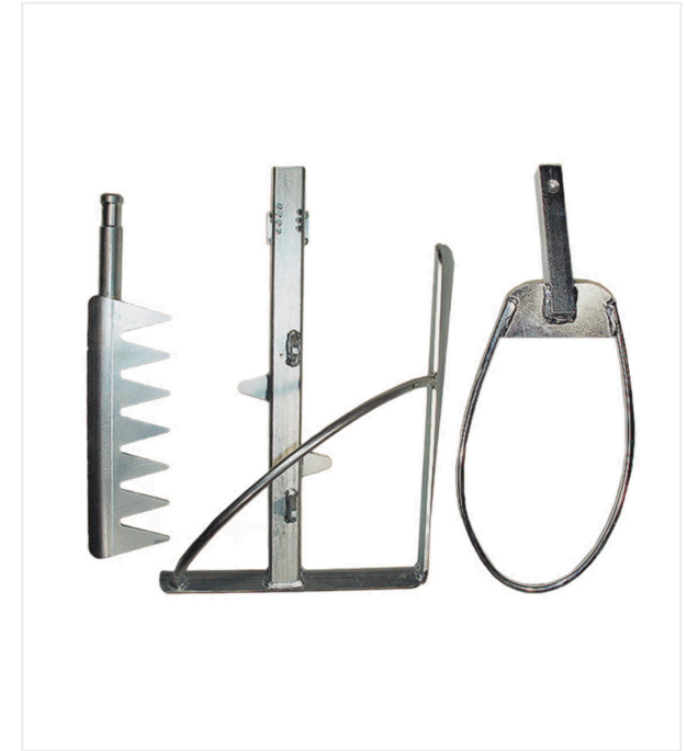
Special mixing tool guarantees a homogeneous mixture