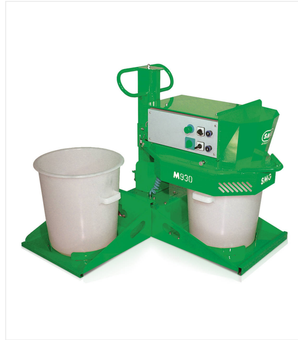
Hydraulically liftable mixing head