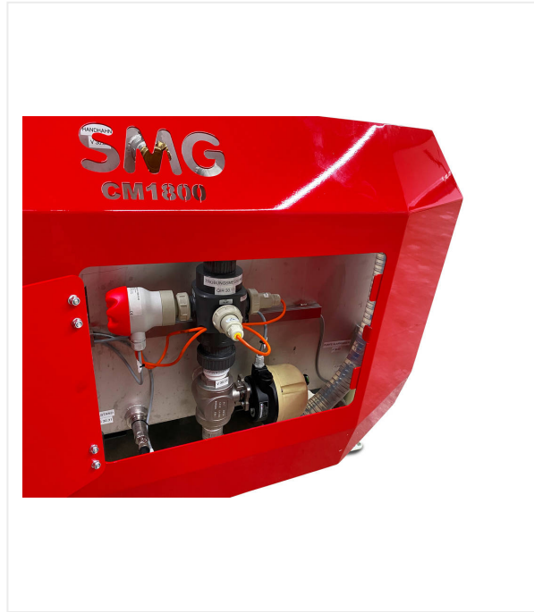
Sensors for checking turbidity, flow and fill levels