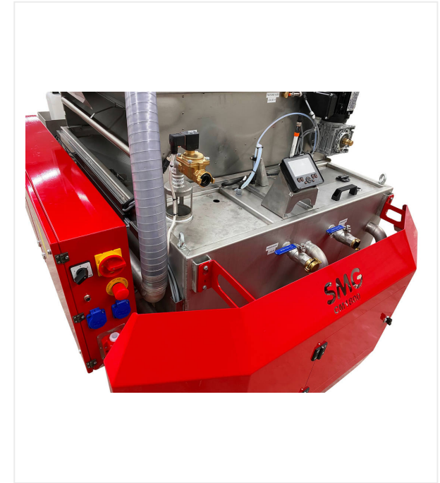
Central switch box with display for controlling all pumps, etc.