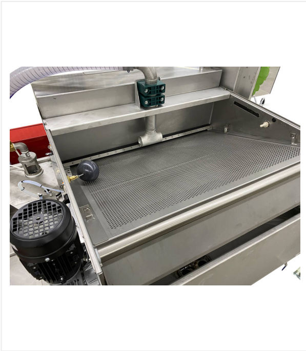
Belt filter with tear-resistant filter fleece (120 µm) including collecting container with float switch