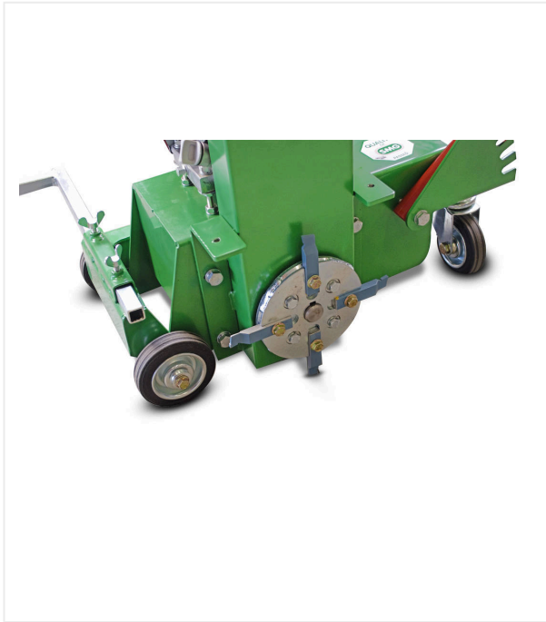
Cutter head with 4 hard metal knives