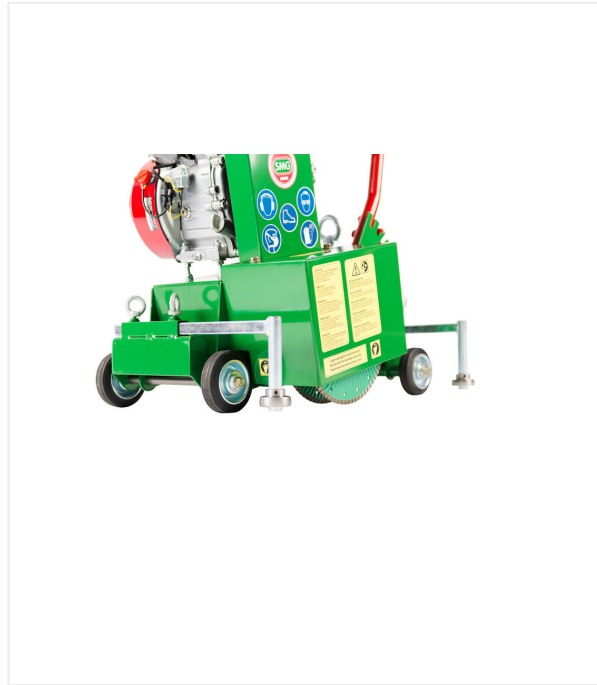
Groove Cutting Machine TF50

TF50 cuts grooves for marking lines for plastic profiles. For this reason, it is equipped with two separate markers. The working depth is infinitely adjustable. The exact cut is ensured by a dipstick and two rollers.