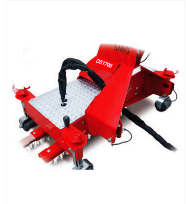
with 3-point rear attachment system, hydraulic drive