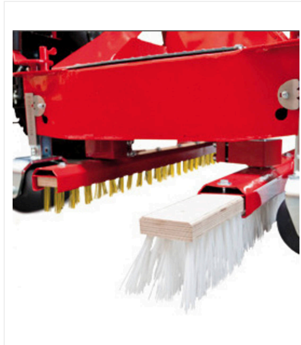
Different hardness/stiffness brushes available for all kinds of requirements, easy to change.