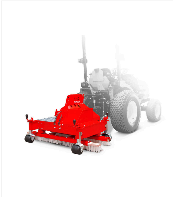
oscillating brush OS1700/OS1700 PTO