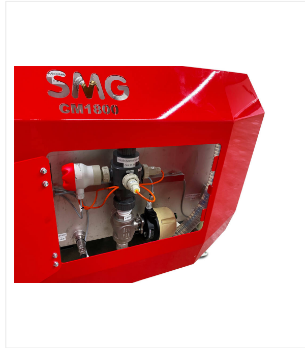
Sensors for checking turbidity, flow and fill levels