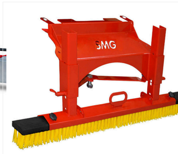
Levelling brush device

Magnet bar ML1500 for artificial turf maintenance. L 1,500 mm x W 300 x H 300 mm