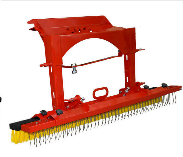
Levelling brush-/ decompacting device