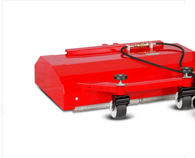
Cleaning brush PGD900

Ground driven spreader for artificial turf.