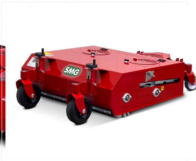
Cleaning brush PGSG1

The all-rounder for maintaining and cleaning of track & turf.