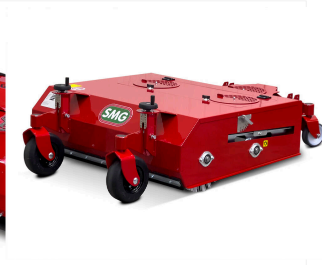
Cleaning brush PGSG1

The all-rounder for maintaining and cleaning of track & turf.