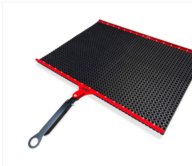
Rubber drag mat