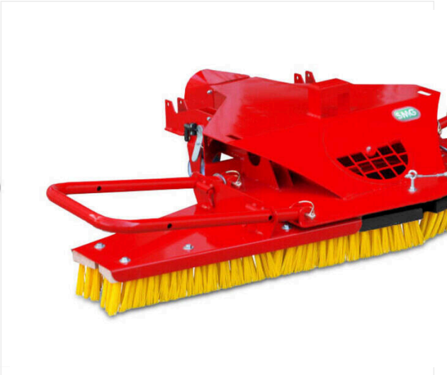
Rigid brush device

Cleaning brush for sand -and/or rubber infilled artificial grass with vacuum.