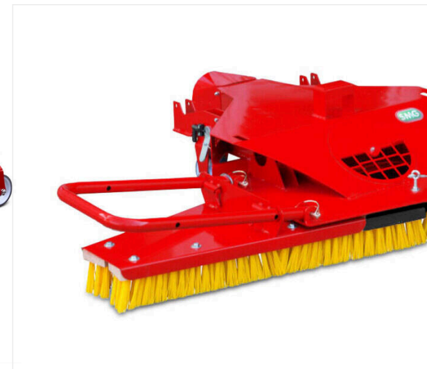
Rigid brush device

Cleaning brush for sand -and/or rubber infilled artificial grass with vacuum.