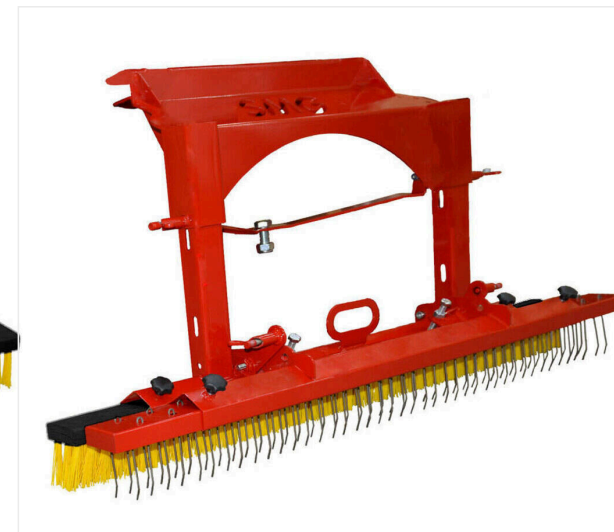
Levelling brush-/ decompacting device