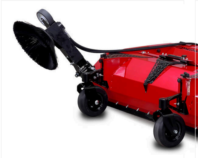
Rotating brush SC3