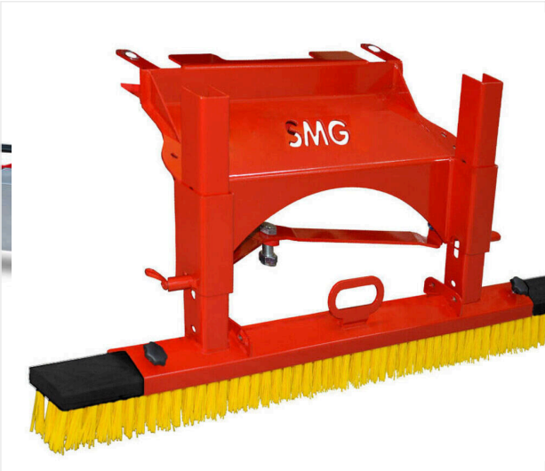
Levelling brush device

Magnet bar ML1500 for artificial turf maintenance.