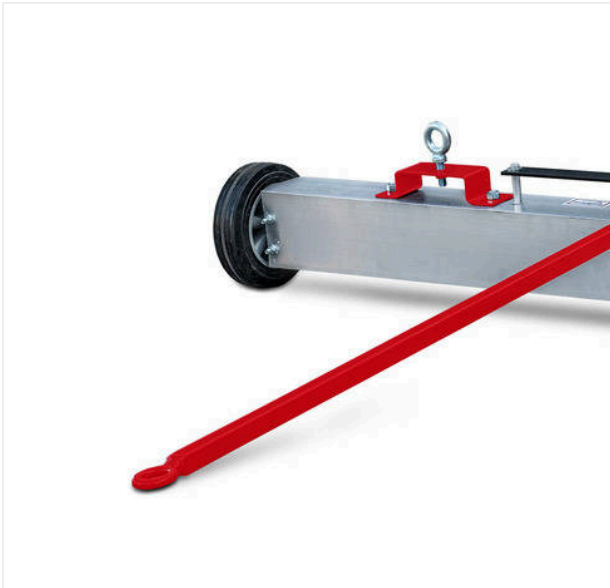
Magnet bar ML1500