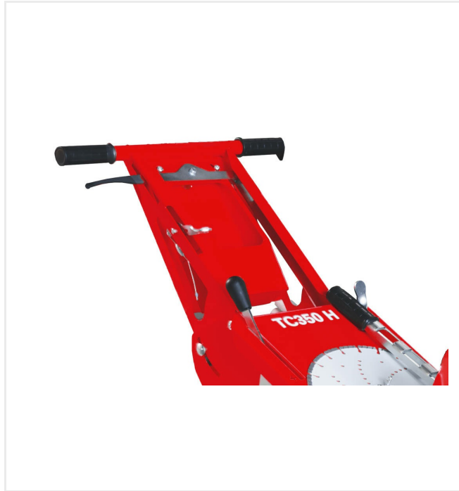
Hydraulic infinitely variable gearing