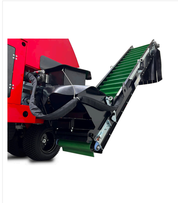
Conveyor belt, 180° rotatable

For transport in a transport frame, easy to attach.