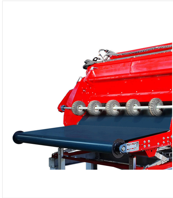
Rewinder for rolls with idlers