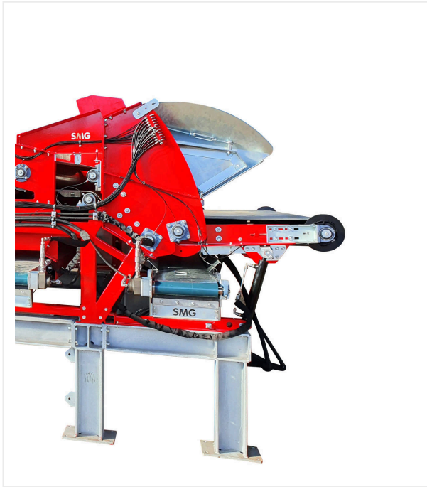
Input area for artificial turf rolls