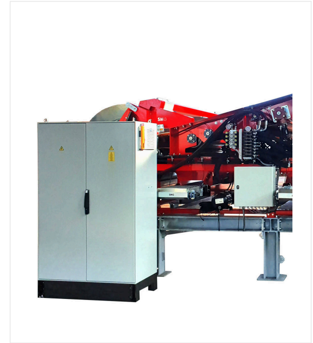
Switch box with controls