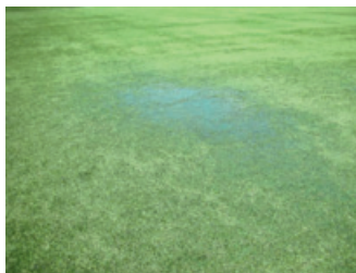
It is crucial to have excellent drainage to avoid standing water on the pitch