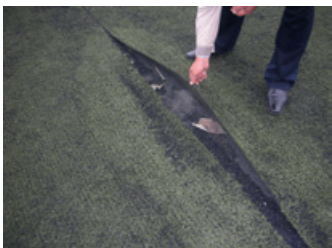
A pitch with open seams is not safe to play on and can cause injuries

If the seams have failed in any place, contact the installing company as soon as possible and insist on an immediate repair under the terms of the warranty. Do not attempt to undertake the repairs yourself.