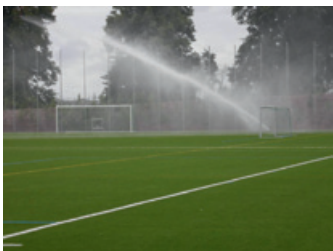
Check your irrigation system periodically

Water has several effects: it will lubricate the surface, cool the surface, stabilise the infill and consequently reduce loss of infill. After heavy rainfall, it is advisable to check the infill levels as they may have become disrupted. This can be particularly significant if the field has a slope and the infill has migrated with the slope.