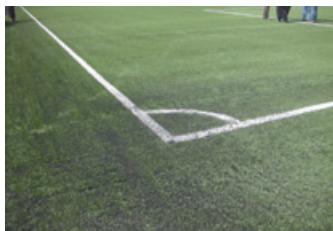
Infill often spreads to other areas of the field