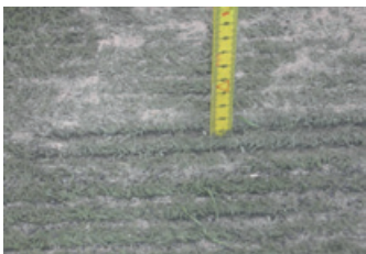
Insufficient infill will destroy the fibre

Replenishment of infill should be made with light equipment or by hand, whichever is most appropriate. With the delivery of the field, the owner should buy additional infill material so that it is always available. Installations should have weekly checks of fill levels on the field. In addition to the weekly check, there should be an annual inspection of the whole pitch to ensure that the fill height is kept at an appropriate level in accordance with the supplier's specifications. Type of granules for replenishment must be determined in consultation with the turf manufacturer.