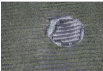
Examples of badly maintained fields