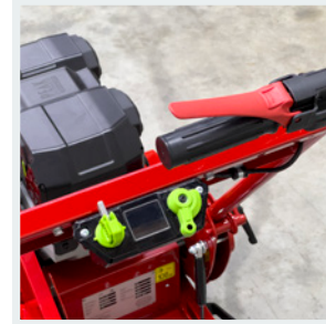
EASY HANDLING Ergonomically arranged operating controls.