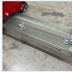
4 - 10 MM SMG adjustable sieve for every particle size.