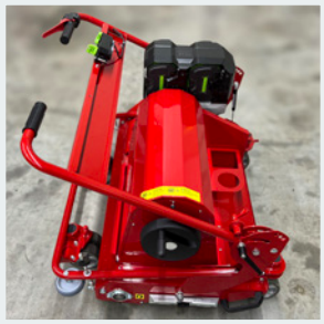
COMPACT Foldable steering arm and 360° swivable wheels to pass doors.