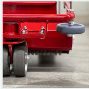
SAFETY Side wheel to avoid collisions on walls.