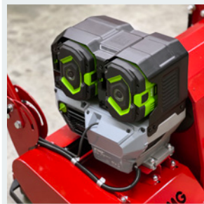
POWERFUL Electric motor with 3.47 kW.