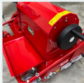
SMG DUST FILTER Dust filter comply with DIN EN60335-2-69/dust class "M" and EN779 "F8" or "F9".