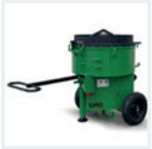
MOBILE Flexible application possibilities and handling.