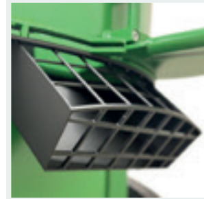
PRECISE Material discharge chute for clean and controlled emptying.