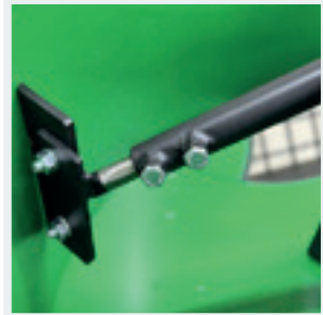
TIME-SAVING The mixing tools are adjustable and replaceable.