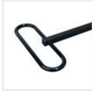
HAND DRAWBAR For easy manual movement of the mixer.