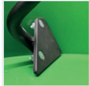
PROVEN Robust agitator for efficient work.