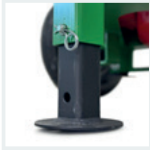
FLEXIBILITY Adjustable filling height for comfortable and ergonomic filling.