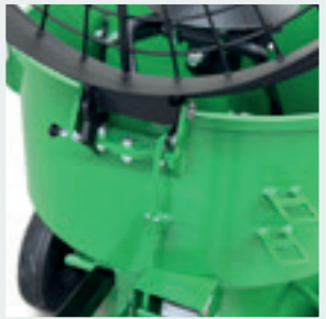
PROCESS RELIABILITY Filling grid with integrated safety shut-off.